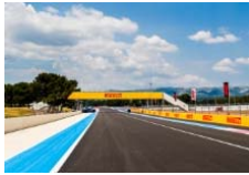
Circuit Paul Ricard