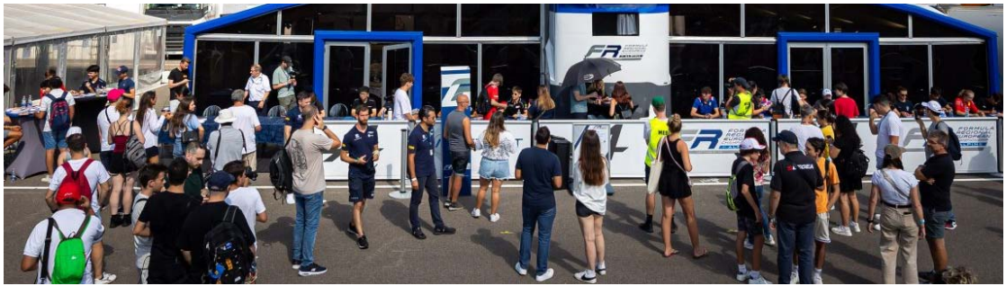
Imola (ITA), September 6 – 8 2024 – Round 7 of Formula Regional European Championship by Alpine 2024 at Autodromo Internazionale Enzo e Dino Ferrari. Ambience.

The international series will return to the track tomorrow morning at 8:30 for the second qualifying session, which will be streamed live on the championship's official YouTube channel.