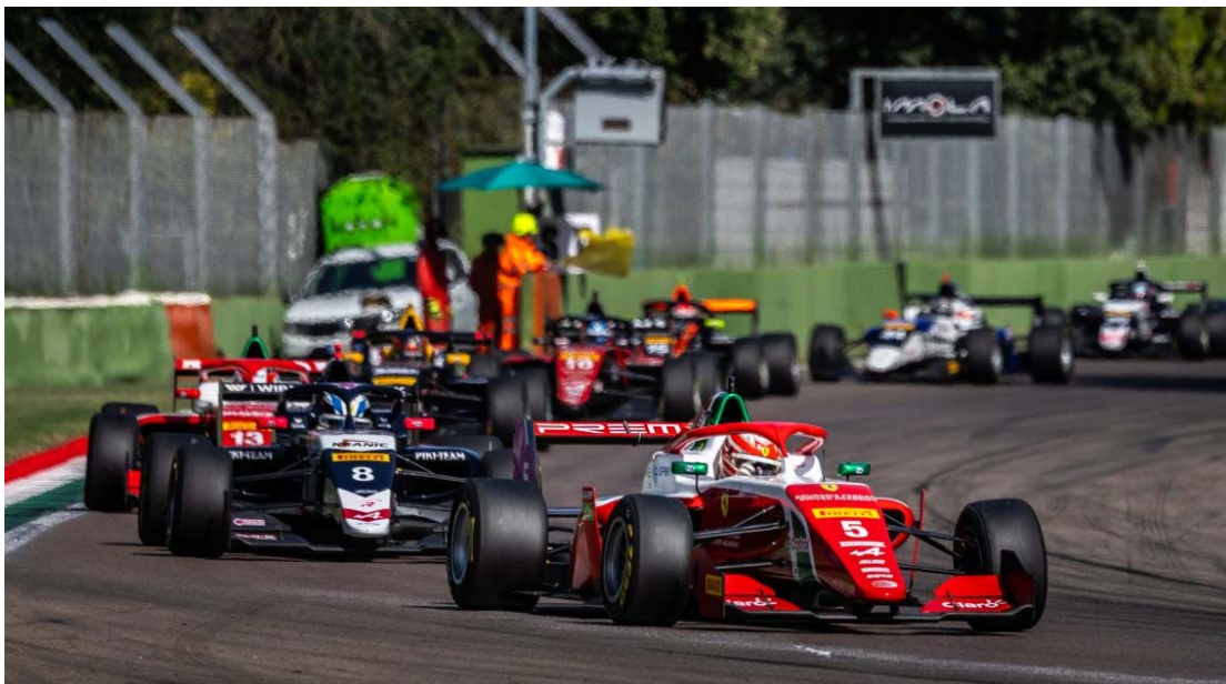
Imola (ITA), SEP 6-8 2024 – Round 7 of the Formula Regional Europea Championship by Alpine at Autodromo Internazionale Enzo e Dino Ferrari. Rafael CAMARA #05, Prema Racing.

A safety car was deployed following a collision between Ivan Domingues (Van Amersfoort Racing) and Nikita Bedrin (MP Motorsport), with both cars stranded in the gravel at the Villeneuve chicane.