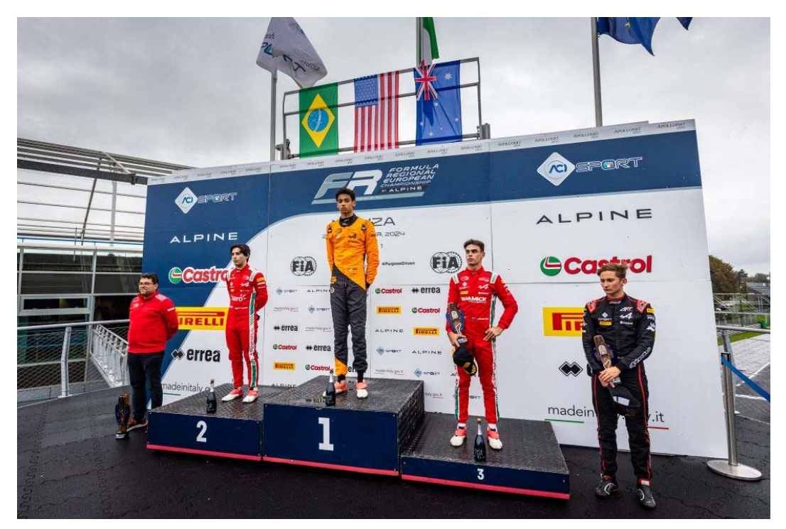
Monza (ITA), October 25-27, 2024 – FRECA Round 10 at Autodromo di Monza, Italy. Podium race 1.

will be broadcast live on the championship's official YouTube page and through the TV broadcasters covering the series.